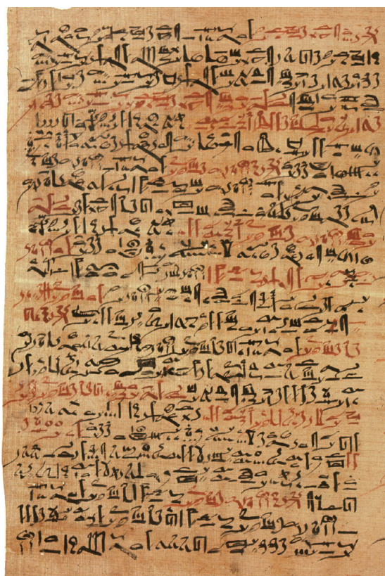
Figure 4: Moore W. The Edwin Smith papyrus [Medical Classics] BMJ 2011;342:d1598 DOI 10.1136/bmj.d1598. A non-specific example of a 1600 BC papyrus

The consideration for a sprain of the vertebrae, as opposed to a vertebral dislocation, was an ailment that would be treated. This approach represents the oldest known evidence of an inductive process in the history of the human mind, with the treatment lasting 'until he recovers, until the period of his injury passes by', or 'until thou knowest that he has reached decisive point.' (17) Sprain of a vertebra is a subluxation; Palmer wrote 'Chiropractic sub-luxations are known in medical parlance as a "sprain"' (21)